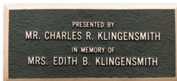
9" x 4"