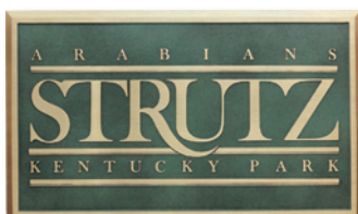
30" x 18"