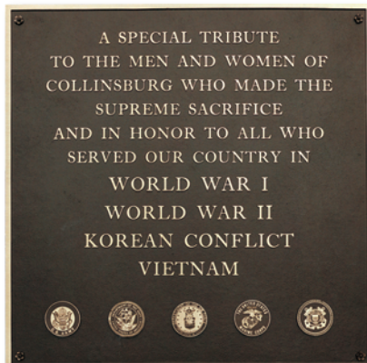
30" x 30"