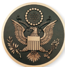
18" or 24"