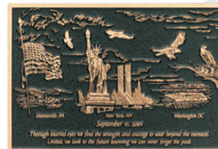
MC-9 4" x 6" Sept. 11, 2001 $216.00

Half-tone Etched Portrait 3 3/4" x 5 3/4" There is a half-tone art charge of $325.00 added to the price of the casting.