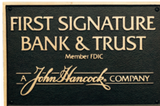
12" x 8"