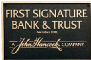
12" x 8"