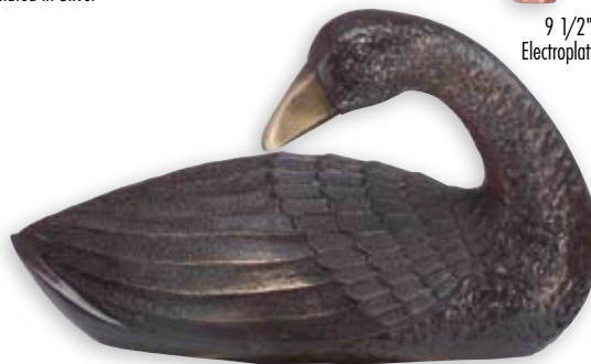
5 3/4" x 9 1/2" Goose Electroplated in Brass, Antique finish