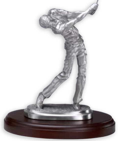
9" Male Golfer Electroplated in Silver