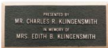
9" x 4"