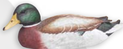
2" x 6" Duck Hand painted