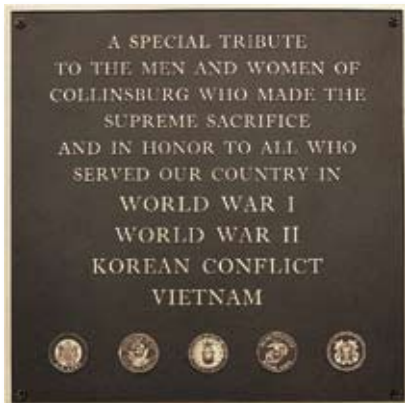
30" x 30"