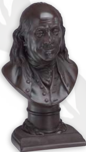
9" Benjamin Franklin Hand painted