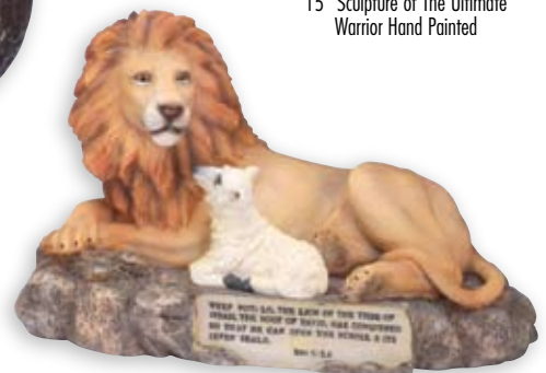
6 1/2" x 9 1/2" Lion with Lamb Hand painted