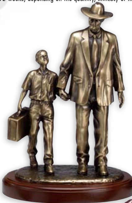
11 1/2" Sheriff with Boy Electroplated in Brass