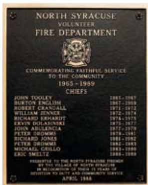
16" x 20"

Below we give you a listing of the most popular sizes and their pricing, any size can be made. Prices are for one plaque. Phone for pricing of multiple duplicate plaques.