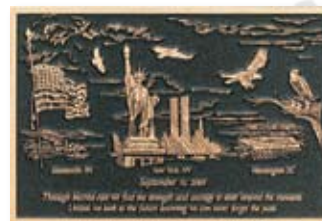
MC-9 4" x 6" Sept. 11, 2001 $216.00

Halftone Etched Portrait 3 3/4" x 5 3/4" There is a halftone art charge of $325.00 added to the price of the casting.