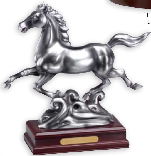
9" Horse Electroplated in Silver