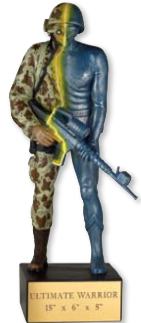
15" Sculpture of The Ultimate Warrior Hand Painted