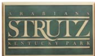
30" x 18"

Bronze tablets are cast in Sand. They can be used indoors or outdoors. Normal delivery is 5–6 weeks. Shorter delivery is possible on an overtime basis. Tablets can also be cast in Aluminum. Aluminum castings are approx. 23% cheaper than Bronze. Edges can be straight or beveled, also single line or double line border. Finishes: Raised Areas Satin Finished. High Polish requires extra pricing. Background, recessed areas, one standard color or stain. The prices in the pricelist below include a Metal surcharge of 26% for Bronze, 16% for Aluminum. Cast Bronze is 90% Copper. Significant changes to the cost of Copper may result in an increase or decrease of this surcharge. Use this pricelist as a guide line, and check with us on the price. The number of letters in the pricelist gives you the ideal number of letters per size. We do not charge for additional letters, but too many additional letters may require a larger size plaque. All plaques are furnished with mounting hardware, except for rosettes which range depending on the size of the plaque from $13.50 to $27.00 ea. Specify what hardware is required. Type A Blind Mount, type B Solid Wall, type C Hollow Wall, type D Wood Wall. Many Military, Fire Department, Civic and Religious Emblems are available and can be