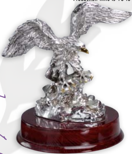
9" Eagle on base Electroplated in Silver

Custom made Highly Sculptured Resin Figures