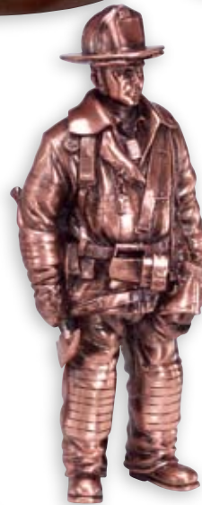
9 1/2" Fireman Electroplated in Copper